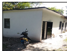
Outside of Braille office.

Handicapped Children and the Haitian Society for the Blind in Port-au-Prince. Please pray for God's Word to be at work in the lives of those who read it.