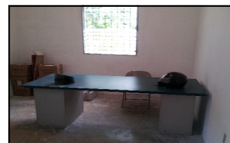
Before Work Begins

plans to transcribe more scripture portions and Christian books into French and Kreyol Braille. These will be available to Braille readers through libraries at the Special School in Cayes, and St. Vincent's Center for